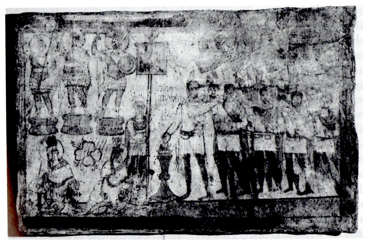
Fig. 2.1. The fresco of Julius Terentius, from the 'Temple of the Palmyrene gods' at Dura-Europos.

the soldiers of the XX Palmyrene Cohort under Julius Terentius, depicted to the right), <sup>112</sup> I do not think the matter is as clear as that.