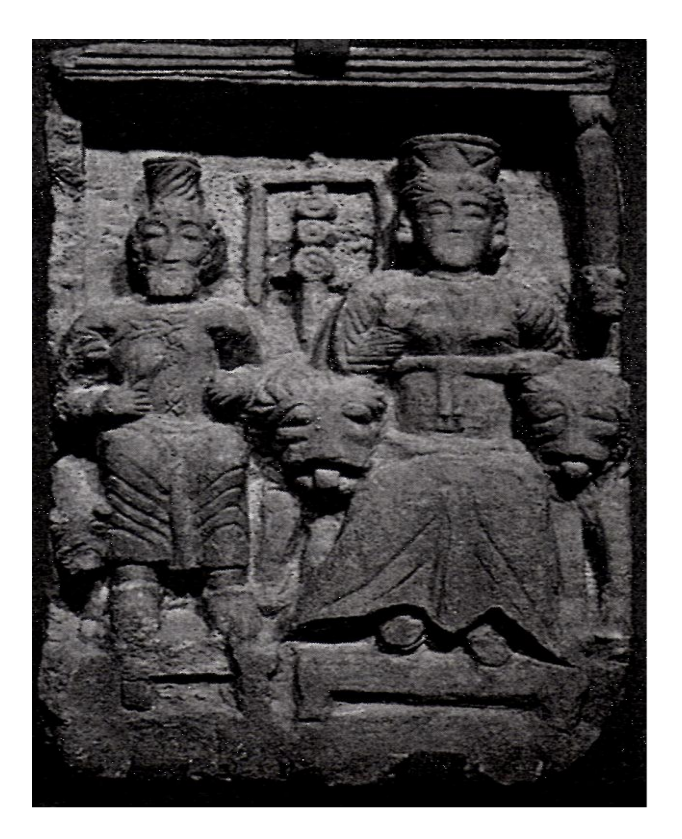
Fig. 2.2 Cult relief from Hierapolis/Mabog, showing (l-r)Hadad, the σημεῖον and Atargatis, flanked by twin lions

concealed, or, more likely, simply not recognised, any distinction between anthropomorphic deities and more 'aniconic' ones. 153